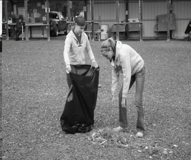
Splinters, wads, bullets, target pieces, the 4Hers picked it all up.

The November IDPA match on the 27th will be a 2 gun backup gun shoot for revolver and semi-auto 3" barrels or less. Loaner guns will be available.