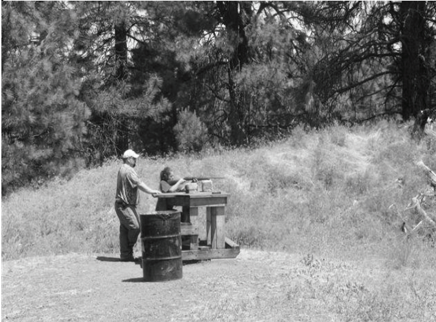
Basics of rifle shooting.

4Shots 4H helping JSSA maintain the ranges and teach responsibility with firearms.