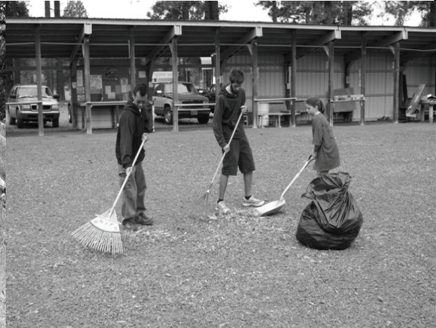
Range cleanup-Little girl, big shovel!